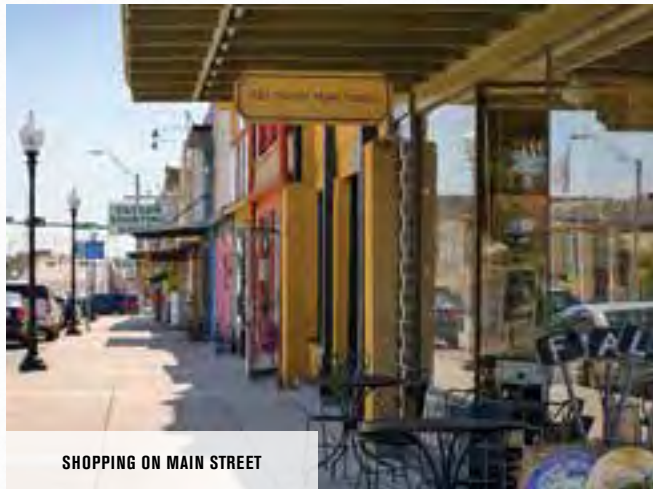
SHOPPING ON MAIN STREET

512-777-3106 vintageaffaire.wordpress.com