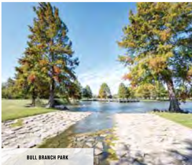
BULL BRANCH PARK