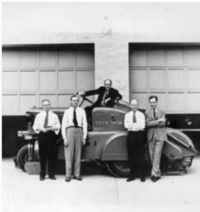
TAYLOR CITY EMPLOYEES

Today, Taylor continues to grow and expand as a part of the regional development in the Austin area.