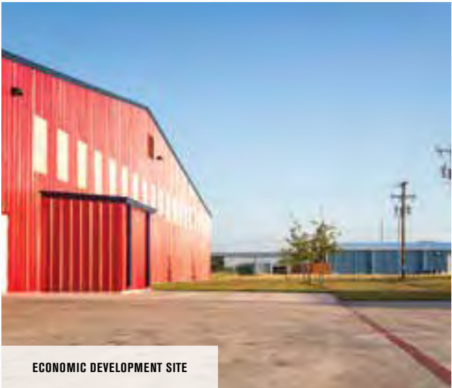
ECONOMIC DEVELOPMENT SITE

The Taylor Economic Development Corporation has developed and constructed a 50,000 sq. ft. speculative site to house incoming industries interested in locating their businesses in Taylor. Furthermore, the TEDC has a variety of commercial and industrial buildings and sites available for lease or purchase at Mustang Creek Industrial Park, at Walnut Creek Commercial Park and in our Historic Downtown.