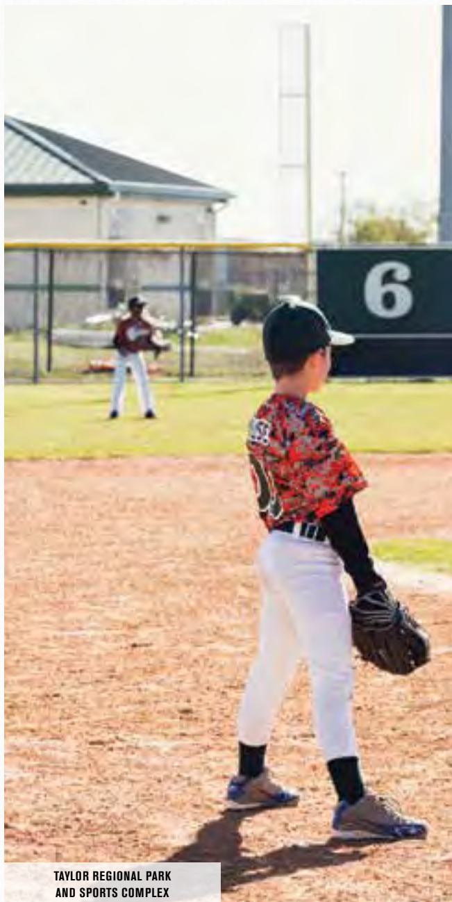
TAYLOR REGIONAL PARK AND SPORTS COMPLEX

This state-of-the-art recreation area, sports facility and nature preserve, located on the southern end of the Blackland Prairie Ecological Region of Texas, is simply magnificent.