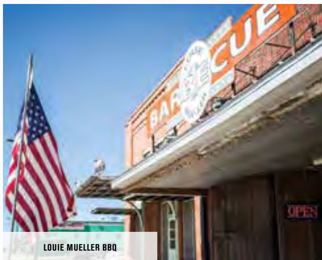
LOUIE MUELLER BBQ

The restaurant is open Mon. – Fri. 11 a.m. – 6 p.m. and Saturday 10 a.m. – 6 p.m., or until the food is sold out. Families and groups are always welcome and travelers are encouraged to call in their order in advance.