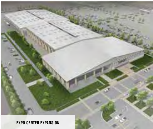
EXPO CENTER EXPANSION

Due to the recent growth and expansion in the region, Taylor has been on the cusp of the development wave for some time now. We are seeing new things coming to Taylor and are looking forward to more exciting developments in the future.