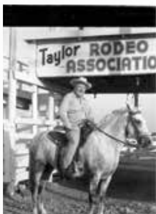
1953 TAYLOR RODEO