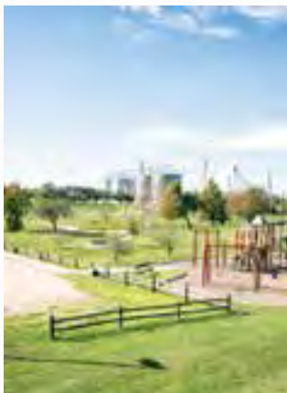
FANNIE ROBINSON PARK