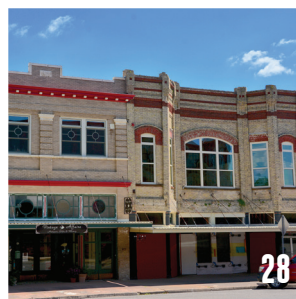
John Bohls Building