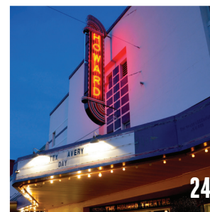
Current Howard Theatre