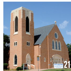
St Mary's Church