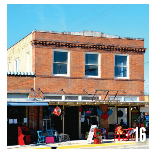
Star Tire Store