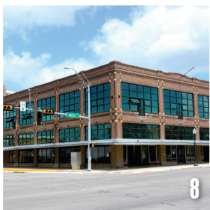
Sturgis-Goldstein Department Store