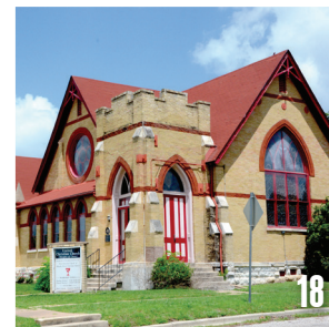
First Christian Church