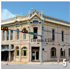
First National Bank