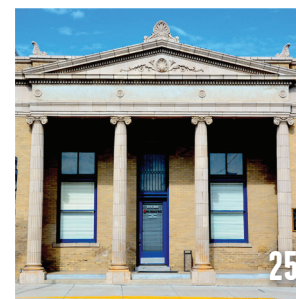
City National Bank