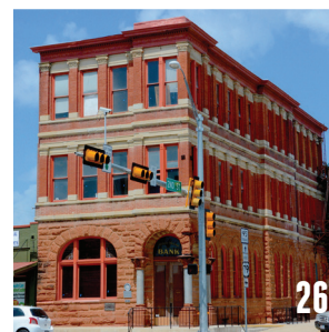
Taylor National Bank