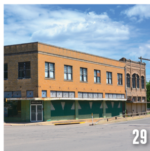
Livery/Blacksmith and Wagon Outfitting and Repair Buildings