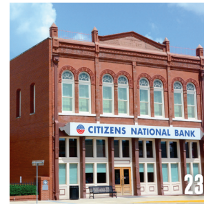
Eikel-Prewitt Hardware Building