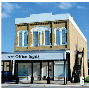
Thompson and Tucker Lumber Company