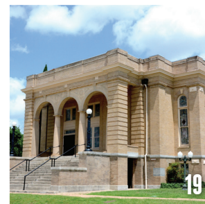
First Presbyterian Church